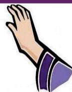
Anointing the sick